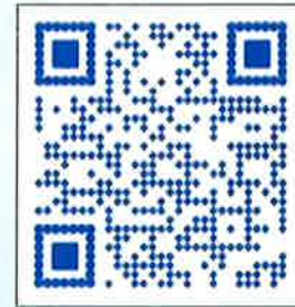
الاستبيان باللغة العربية